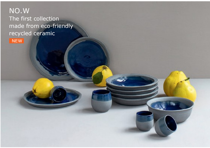
NO.W The first collection made from eco-friendly recycled ceramic