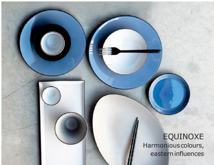
EQUINOXE Harmonious colours, eastern influences