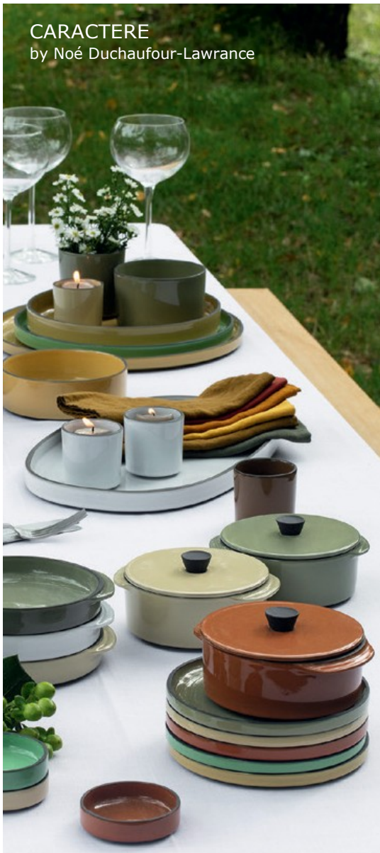
CARACTERE by Noé Duchaufour-Lawrance