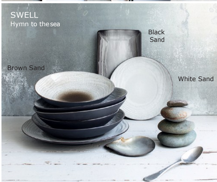
SWELL Hymn to the sea